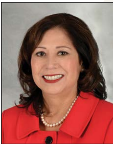
HILDA L. SOLIS