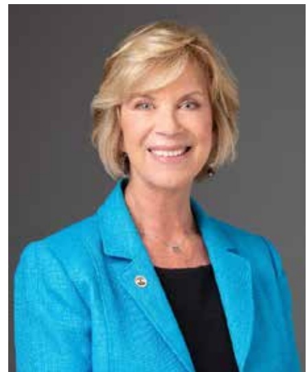
JANICE HAHN Supervisor, Fourth District County of Los Angeles