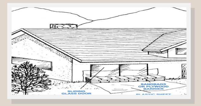
Fig. 11 SLIDING GLASS DOOR SEALING Control of flows to prevent seeping around sliding glass doors.

CAUTION: Do not use straw or bales of hay in lieu of sandbags. They do not perform as well as sandbags and may be washed away.