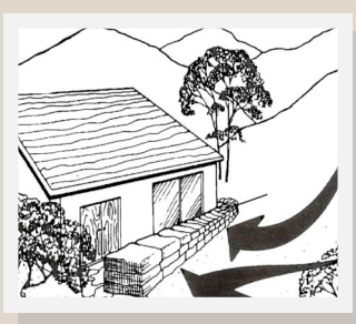
Fig. 10 Building Protection