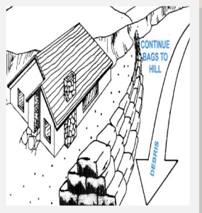
Fig. 7 DIRECTING DEBRIS AWAY FROM BUILDING