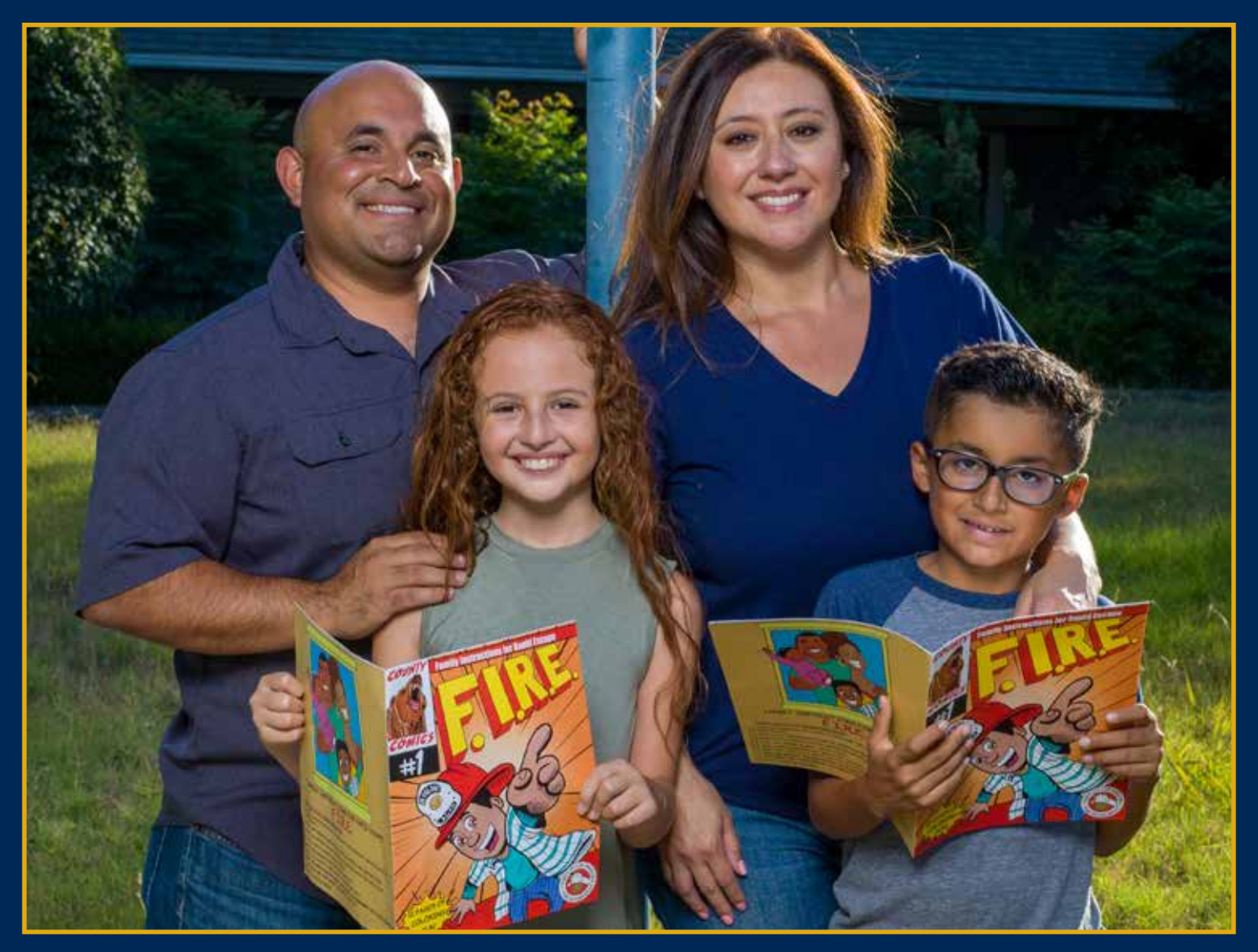
As with all fire safety, planning ahead is key! <u>Do not wait for fire to strike to think about your escape</u>. Planning ahead can save your life!