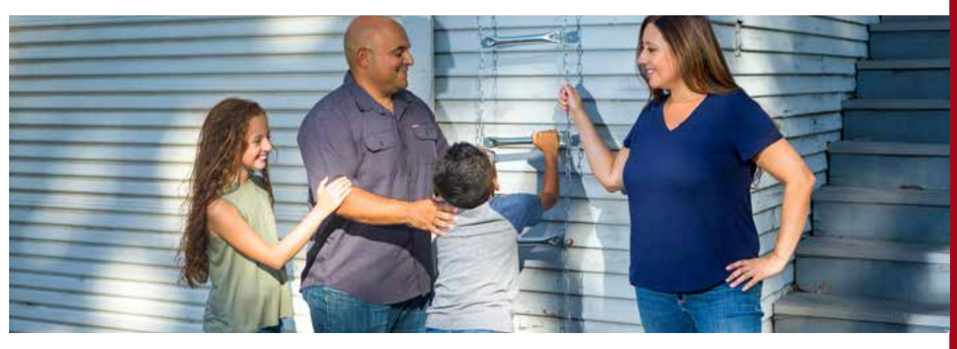
If your smoke alarm activates, here are your options to escape.