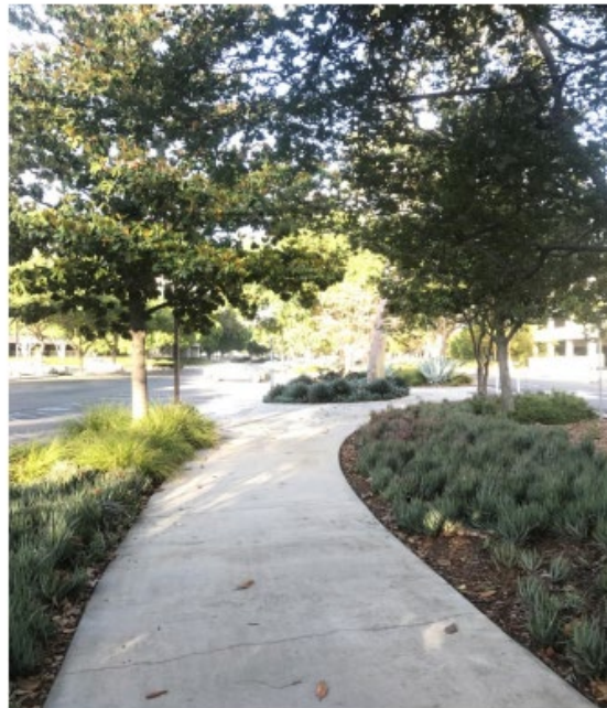
Figure 2: Eliminate the vertical and horizontal continuity. This is a good example of adequate separation.