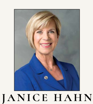
Supervisor, Fourth District