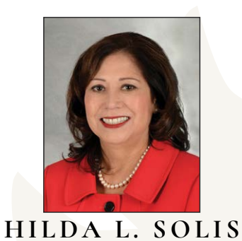
Supervisor, First District