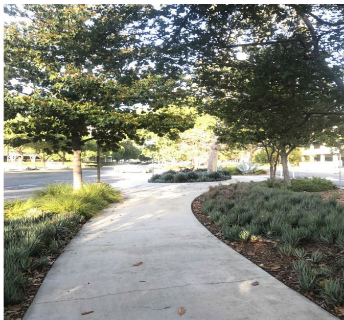
Figure 2: The concept of fuel ladders is crucial to planning a Fire-Wise landscape. No matter which plants are chosen, providing sufficient and defined separation between ground covers, shrubs and trees is the most crucial consideration in the design/plant-selection process. Do not use large shrubs or plants under tree canopies that may grow to a height greater than 2 feet at maturity. Pruning is not a long-term alternative to height appropriate plant selection.